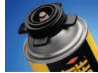
Cleaner with black gun adapter mechanism.