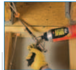
Electrical wire penetration