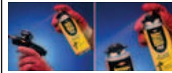
Remove uncured foam from gun adapter on can.