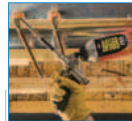
Fireplace gas line