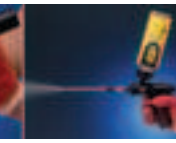
Clean residual uncured foam from inside of gun.