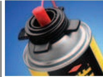
Cleaner with red spray nozzle attached.