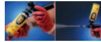
Attach gun to can.