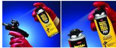
Remove uncured foam from gun. | Remove uncured foam from gun adapter on can.

Cured foam should only be removed from the adapter using a blunt tool, such as a piece of wood. Do not attempt to scrape cured foam off the adapter with a sharp object; this can scratch the adapter coating and cause foam to get in the cracks and scratches, impairing proper loading of cans and leading to eventual gun failure.