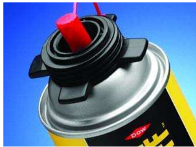
Cleaner with red spray nozzle attached.

Uncured GREAT STUFF PRO™ Insulating Foam Sealant and Adhesive can be removed from the adapter and the gun's exterior surface with GREAT STUFF PRO™ Gun Cleaner, using the red spray nozzle attachment.