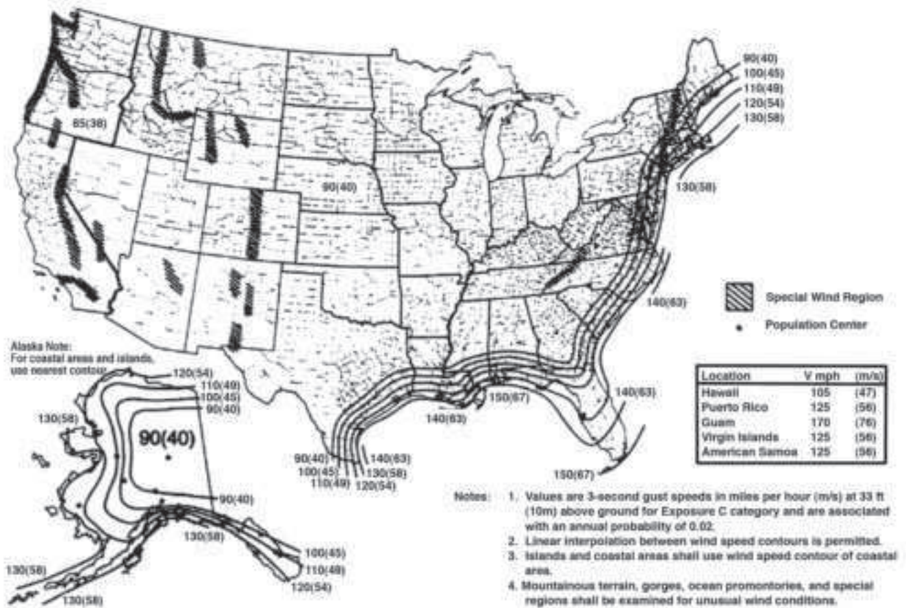
Figure 1: Basic Wind Speed Map

Reprinted from ASCE 7-95 Minimum Design Loads