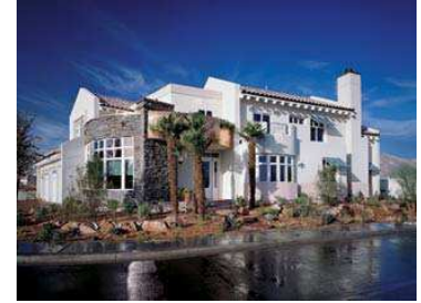
New American Home, 1993 Las Vegas, Nevada

What's more, Dryvit standard, specialty and elastomeric finishes, as well as coatings, offer low maintenance advantages such as DPR (Dirt Pickup Resistance) and PMR™ (Proven Mildew Resistance). Dryvit presents a wide range of custom colors and textures for any architectural style on new or retrofit projects – all with written Dryvit materials warranty.