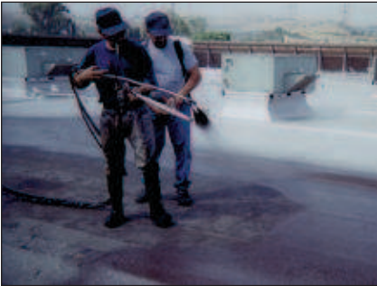
Sprayed in place membrane