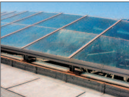
San Francisco International Airport

DEK-TOP WALKWAY PADS provide a safe and attractive walkway on built-up roofs.