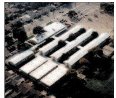
Los Angeles School District