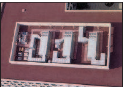
DEK-TOP around cooling towers which require routine maintenance