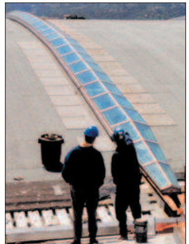
San Francisco International Airport

DEK-TOP is stocked in 3' x 4' by 1/2" thick panels with a granulated top surface (white granule standard). Other granule colors available upon request. The standard 1/2" DEK-TOP weighs approximately 3.75 pounds per sq. ft.