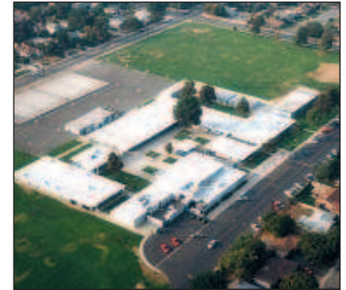
Los Angeles School District

To find out more about this quality system and potential energy-saving benefits, please give us a call at 800-562-5669. Top your new roof system off with DEK-TOP WALKWAY PADS and provide a safe and attractive walkway on built-up roofs.