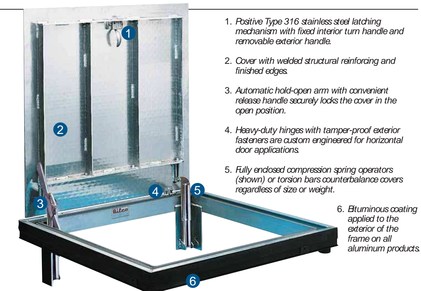
Type JAL Door shown