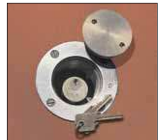
Keyed Cylinder Locks

Deadbolt cylinder locks provide keyed exterior access and are available with either keyed or turn knob interior access. Cylinder locks are an ideal security enhancement for many applications. For added security and weathertightness, the lock cylinder is accessed from the exterior through a gasketed, threaded deck plate.