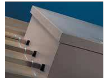
Curb Modification for Metal Buildings