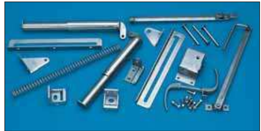
Stainless Steel Hardware

For installation in highly corrosive environments, Bilco fire vents and roof hatches may be equipped with Type 316 stainless steel hardware, including: slam latch and lifting mechanism assemblies; hold-open arms and guides; and all brackets, hinges, pins, and fasteners.