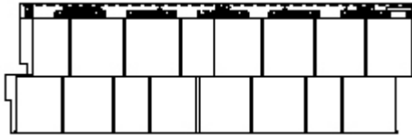
Double 7-inch Straight Edge Perfection