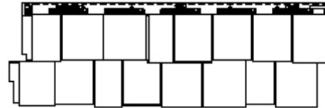
Double 7-inch Staggered Perfection