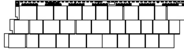
Triple 5-inch Straight Edge Perfection Shingle