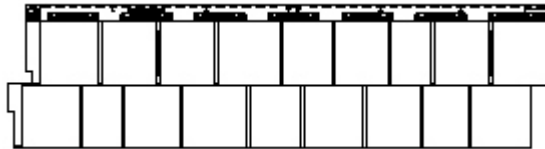
Double 7-inch Straight Edge Rough-Split Shakes