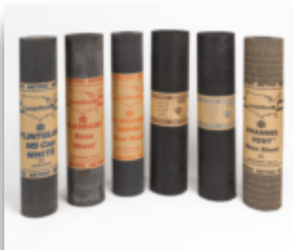
BUR (Built-Up Roofing)