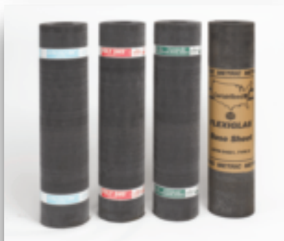
SBS Modified Bitumen