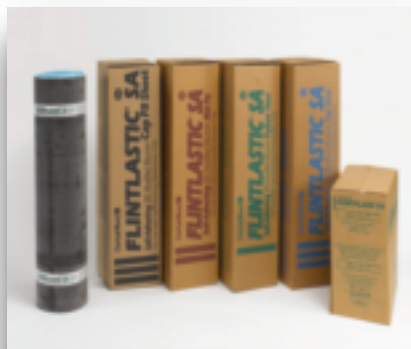
Self-Adhering SBS Modified Bitumen