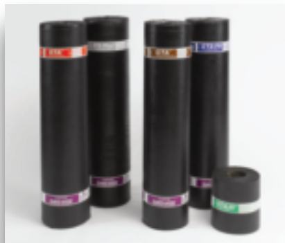
APP Modified Bitumen