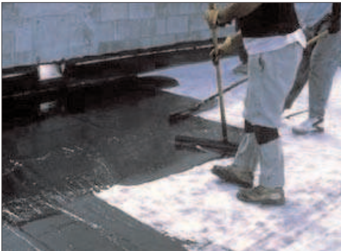
STRATASEAL HR reinforced membrane being installed over a concrete deck to a 215-mil (5.5mm) thickness.

Installation of the Split-Slab Deck Construction Assembly begins with the STRATASEAL HR waterproofing membrane. Install the reinforced, hot-applied rubberized asphalt membrane to a 215-mil (5.5mm) thickness as outlined in the STRATASEAL HR "Installation Guidelines" TechData, including primer and all reinforcing, flashing, detailing and protection course requirements. Then perform, as applicable, water testing as outlined in the "Installation Guidelines" TechData. After a successful water test, the subsequent material layers of the split-slab assembly can be applied over the waterproofing membrane. STRATASEAL HR can be installed on and perform in applications that are dead-level and may see standing water.