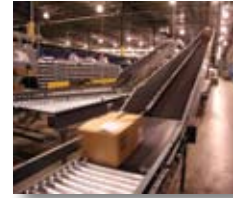
Industrial Packaging & Distribution