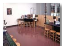
Schools & Universities