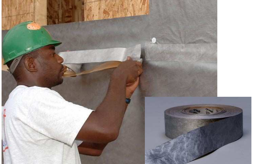
On the wall, courses of Tyvek® ThermaWrap™ are lapped shingle-style from bottom to top to shed water, while taping seams ensures an effective air barrier (above left). Best practice is to seal the joints of Tyvek® ThermaWrap™ with DuPont™ Tyvek® Metalized Tape (above right).

Tyvek® ThermaWrap™ has a very high vapor permeability (36 perms), which makes it the only high-perm reflective membrane available today. Due to its high vapor permeability and thermal resistance, it provides the best possible control of condensation in a wall structure, helping to minimize the risk of mold, mildew and wood rot. This is especially important to keep in mind in hot, humid climates, where foil-faced sheathing and other radiant barriers are often installed on the exterior to reflect heat away from homes. Aluminum foil is a perfect vapor barrier, so whenever the vapor drive moves from inside to the outside – a common occurrence whenever the outside temperature drops below the indoor temperature – humid air will become trapped behind the foil. This is a leading cause of mold and rot in Gulf coast homes.