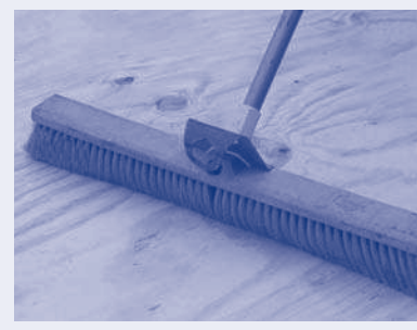
Step 1 Sweep dirt from substrate