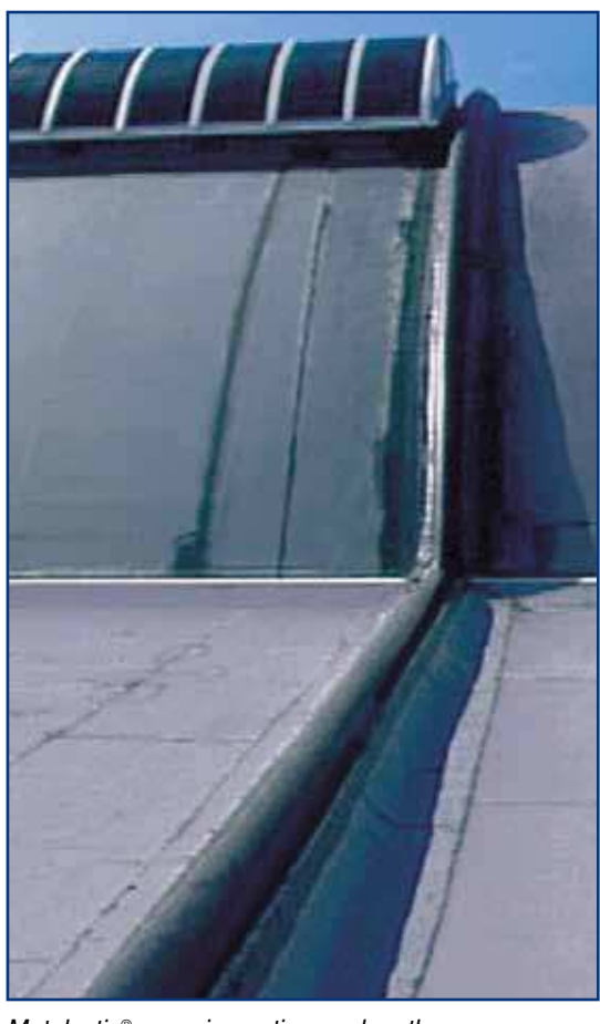
Metalastic® cover in continuous length run