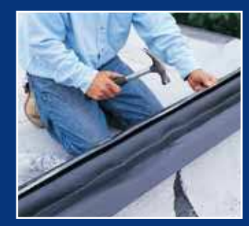
Compress bellows by aligning opposite nailing flanges with opposite curb edge and fasten