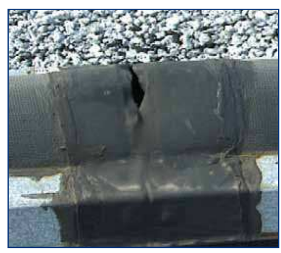
Splice Failure on Competitor's product

The Solution: Metalastic<sup>®</sup> Expansion Joint Covers in continuous lengths up to 250' eliminate up to 90% of splices— and leaks