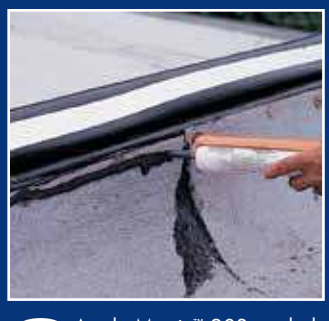
Apply Matrix™ 203 asphalt cement to vertical curb faces (or order with Metalastic® Butyl Tape Sealant), fold down and fasten outside nailer