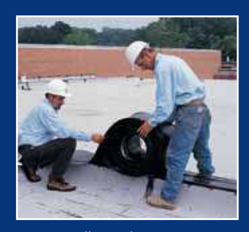
Unroll Metalastic® Expansion Joint Cover