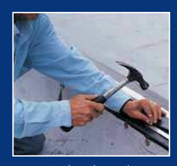
Nail inside metal nailer on one side