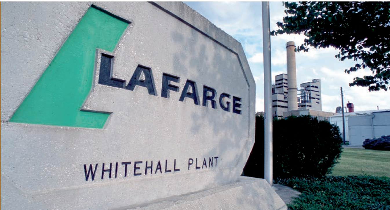
▲ The Whitehall Plant, located in Allentown, Pennsylvania, provides well cements across the northeast U.S.

When well cement for the oil and gas industry is produced, the clinker is analyzed microscopically. Lafarge's attention to quality and consistency is demonstrated in its design and testing of cements to perform with specific admixtures to help achieve desired rheology and thickening times. Lafarge monitors the performance of its products in end-market applications so as to evolve its product and service portfolio.