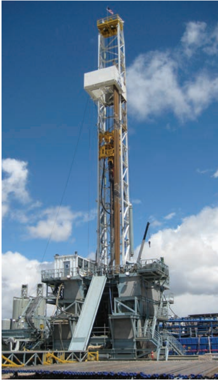
▲ Typical oil or gas drilling rig.