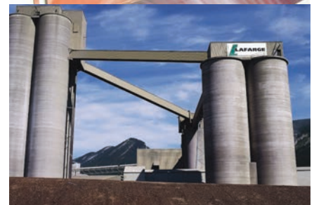
▲ Large mills grind the well cement clinker to meet requisite specifications.