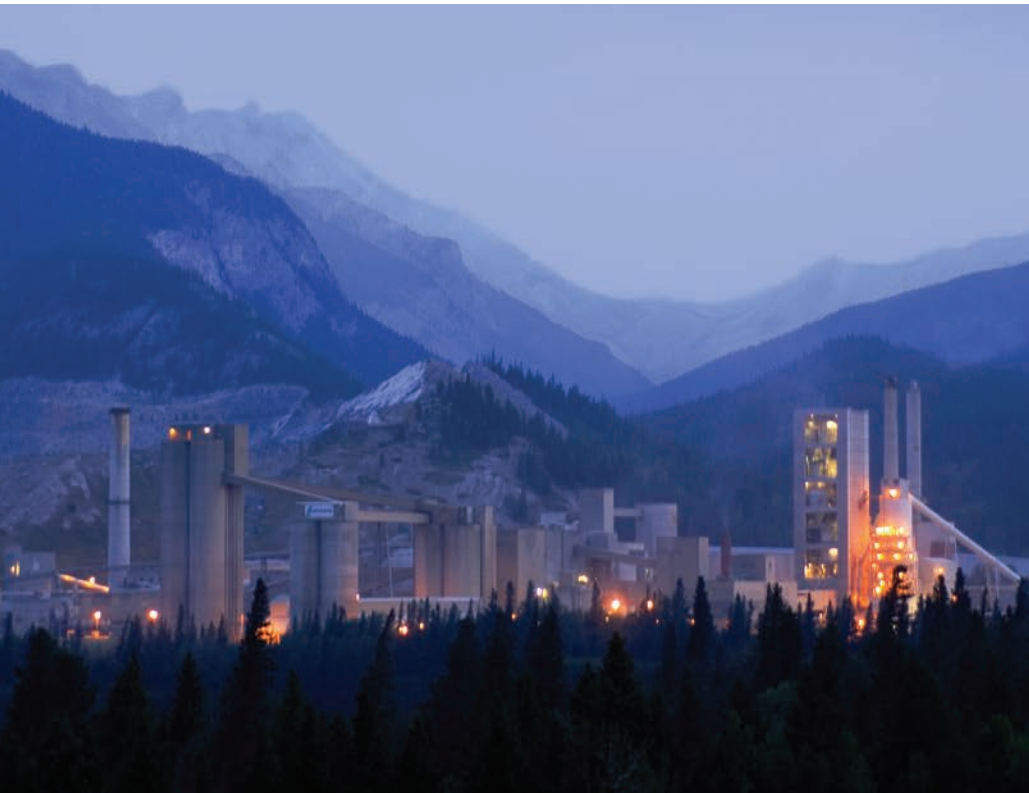
▲ The Exshaw Plant is located west of Calgary, Alberta. The plant serves the oil and gas fields in western Canada, Alaska, North Dakota and Montana.

▼ HT-HP “thickening time” testing is part of the Joppa Plant quality control process. Test temperatures reach as high as 315° C (600° F).