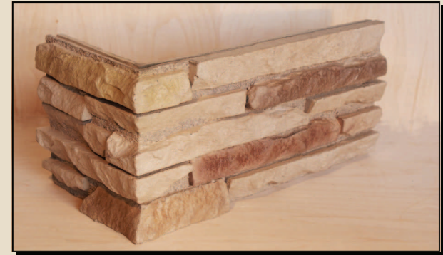
Pre-Mitered Outside Corner Pieces