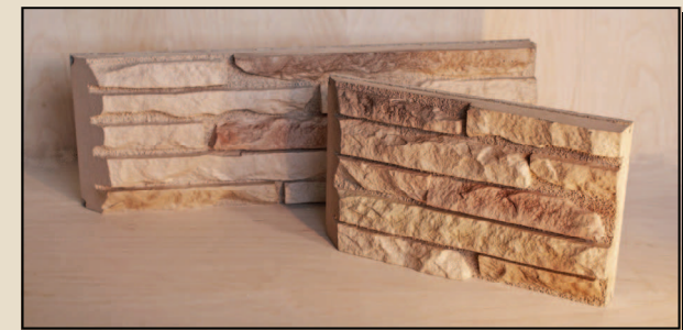
Inside Corner Pieces