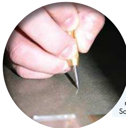
Fig. 4 - Hardness test: Here, a hardness pick is used to test the hardness of a honed performance floor, as measured on the Mohs Scale.