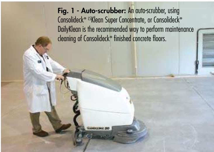
Fig. 1 - Auto-scrubber: An auto-scrubber, using Consolideck® LS Klean Super Concentrate, or Consolideck® DailyKlean is the recommended way to perform maintenance cleaning of Consolideck® finished concrete floors.