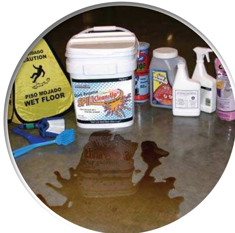
The Consolideck® Quick Response Spill Clean-Up kit for concrete floors has the basic tools, instructions and materials for cleaning most spills before they cause stains.

Never use acidic or alkaline cleaners on Consolideck® floors.