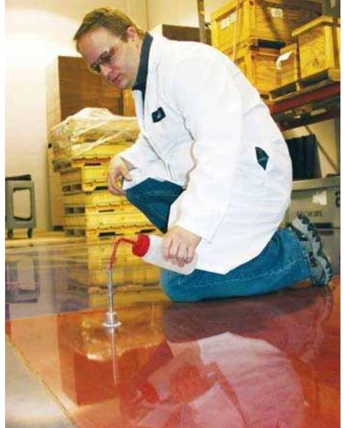
Fig. 3 - Rilem Tube Test: Consolideck® professionals are trained in the use of the standardized performance test kit. Here, a technician uses the kit's Rilem Tube to check the water-resistance of a Consolideck® Decorative Performance Floor.

Consolideck® professionals are fully trained in the use of the performance test kit.