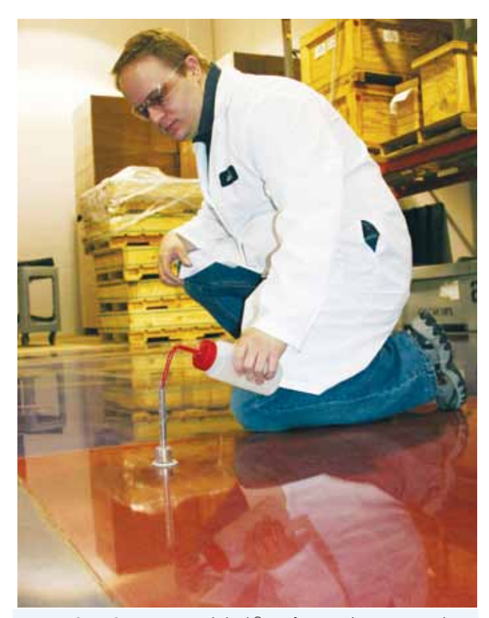
Fig. 3 - Rilem Tube Test: Consolideck® professionals are trained in the use of standardized performance tests. Here, a technician uses the kit's Rilem Tube to check the water-resistance of a Consolideck® Decorative Performance Floor.

Consolideck® professionals are fully trained in the use of the following performance tests: gloss meter, hardness pick set, and Rilem tube.