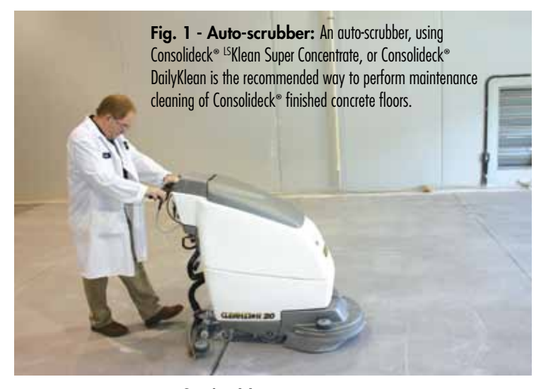
Table 1: Suggested minimum maintenance schedule.