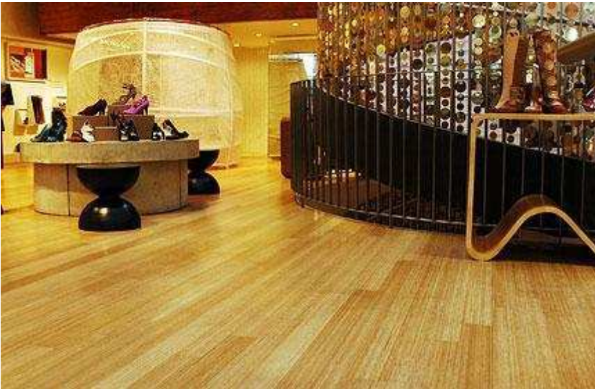
Te Casan shoe store New York, NY Commercial Flooring Edge grain, amber

Unique to the hard surface flooring industry, Plyboo has become the most recognizable and respected name in bamboo flooring and can be found in retail, commercial, and residential projects throughout America. With its durability, easy installation, and good looks, Plyboo is specified for its environmental credentials and its versatility. Plyboo Edge Grain bamboo flooring is produced prefinished or unfinished in a natural or amber color, and is available as PlybooPure urea-formaldehyde-free or FSC-certified PlybooPure. A comprehensive range of trim moldings is available.