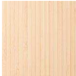
Mountain white stain