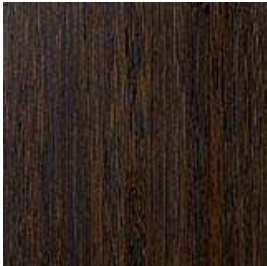
Foundation brown stain