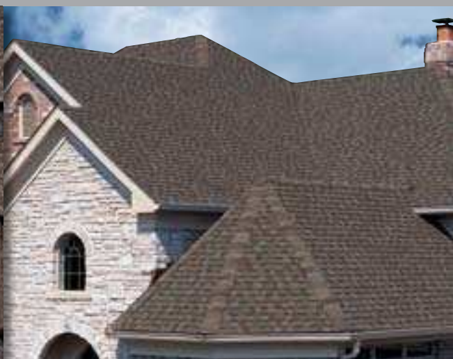
NATURAL TIMBER AMERICA'S NATURAL COLORS