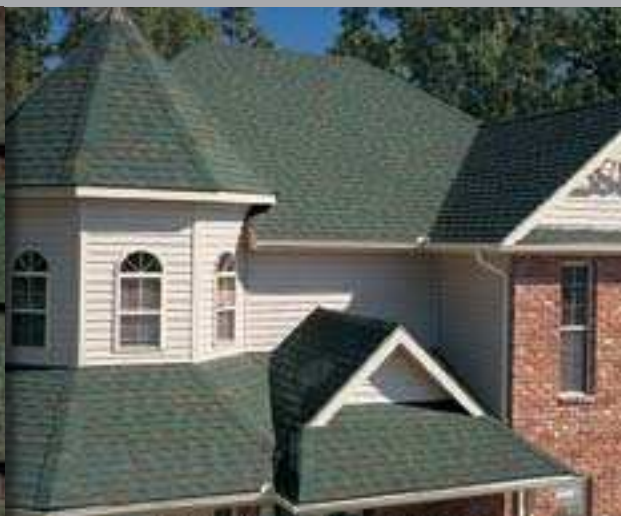
FOREST GREEN AMERICA'S NATURAL COLORS