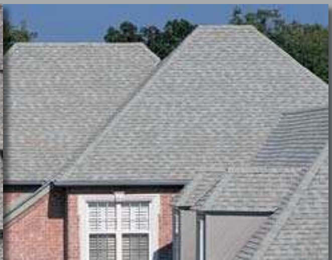
OLDE ENGLISH PEWTER CLASSIC HERITAGE COLORS