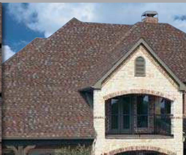
MOUNTAIN SLATE AMERICA'S NATURAL COLORS