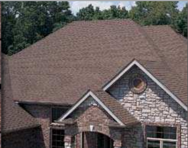
RUSTIC SLATE CLASSIC HERITAGE COLORS