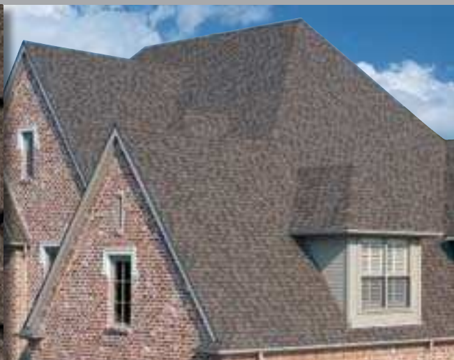
WEATHERED WOOD CLASSIC HERITAGE COLORS