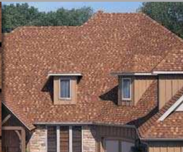
HARVEST GOLD AMERICA'S NATURAL COLORS®