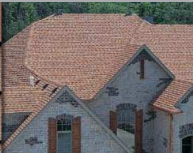
PAINTED DESERT AMERICA'S NATURAL COLORS®