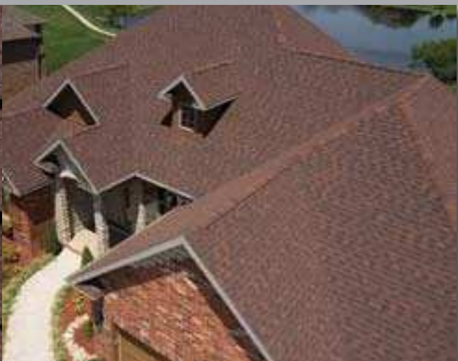
RUSTIC HICKORY CLASSIC HERITAGE COLORS