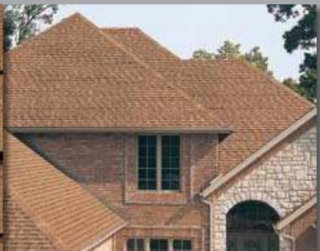
RUSTIC CEDAR CLASSIC HERITAGE COLORS