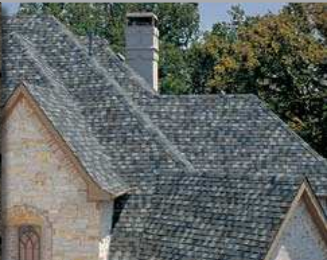
THUNDERSTORM GREY AMERICA'S NATURAL COLORS