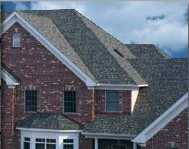
OXFORD GREY CLASSIC HERITAGE COLORS