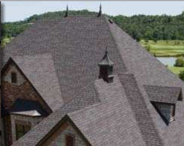
BLACK WALNUT AMERICA'S NATURAL COLORS®