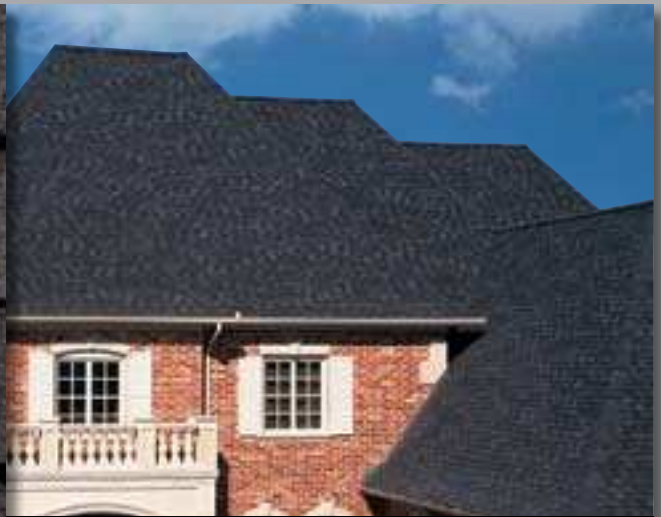
RUSTIC BLACK CLASSIC HERITAGE COLORS