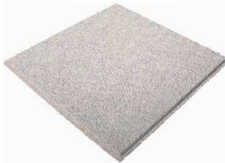
SOFT LOOK TONICO

As its name suggests, this durable ceiling panel features a softer, less harsh appearance.