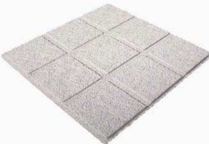
DESIGNER SERIES PLUS

A unique linear look with panels as long as 8'.