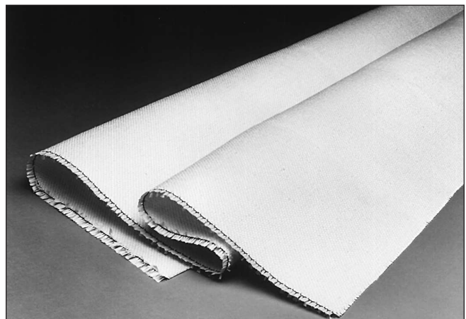
Flexweave 1000 Cloth