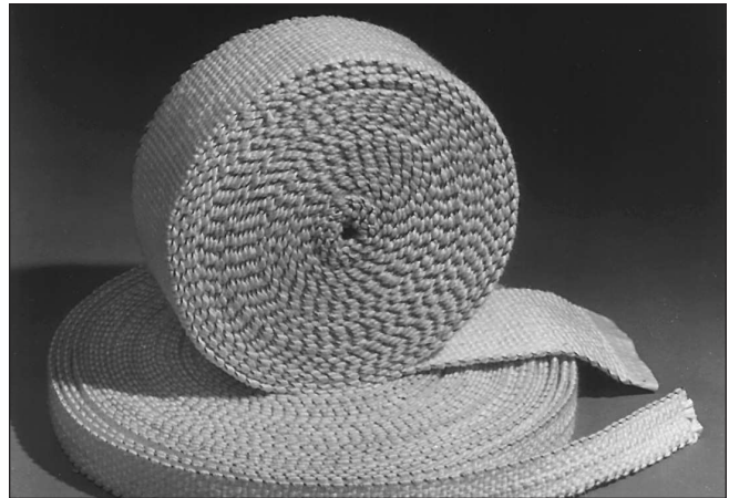
Flexweave 1000 Tape

In addition to the Fiberfrax woven products, the Fiberfrax textile product family also contains a variety of ropes, braids and wicking products. These products are dense, resilient, ceramic fiber materials, widely used for a broad variety of high-temperature gasketing, packing, and sealing applications. For additional details on the available product forms, typical properties or applications for which they are appropriate, refer to Fiberfrax Ropes, Braids and Wicking, Product Information Sheet, Form C-1426.