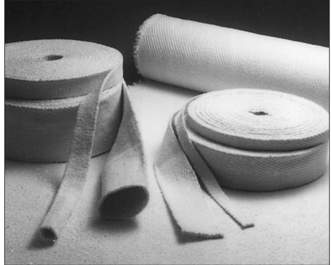
Fiberfrax Cloth, Tape and Sleeving

*Determined by irreversible linear change, not melting point