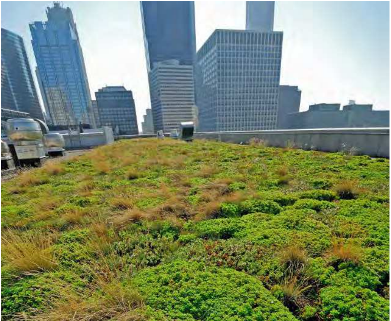
A green roof tops the Chicago building where USG's corporate headquarters are located.

Water is another natural resource that USG is committed to using responsibly. Both wallboard and ceiling tile manufacturing use water and emit excess water vapor from our emission stacks.