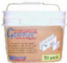
Comes in buckets of 50 Or boxes of 90

Quick and easy to install, the 4"x 8" mesh Grappler is pushed onto the foam wall before the drywall is installed. When it is between the drywall and the foam, it becomes a locking washer with 175 pounds per