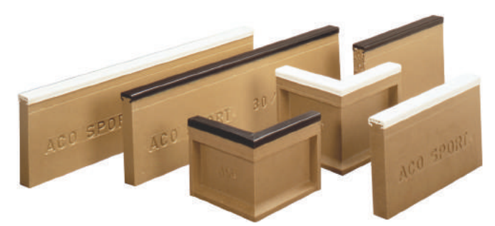
ACO Sport System 7000 safety curbs with cellular rubber capping for jump pits, borders and playgrounds.

ACO Sport offers a number of safety edge products to soften those transition areas. Channels and curbs that offer an integral, cellular rubber cap are proven to minimize the risk and severity of impact injuries.