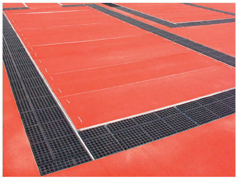
Safety curb edging around the jump pits provide soft edges to the jump pit once covers are removed.