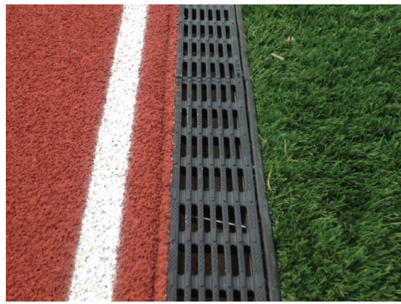
Safety edge channel used to soften the transition from turf to track.