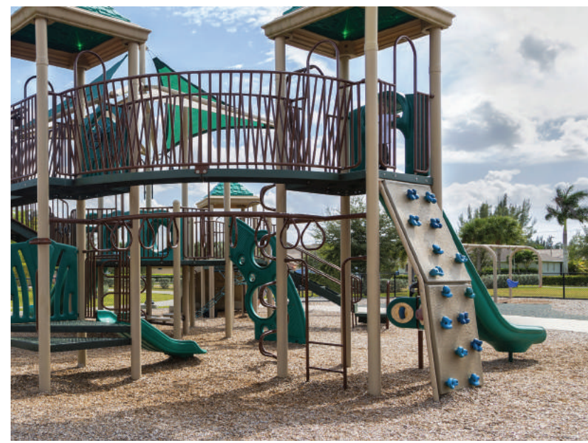
The rate of playground-related injuries at North Carolina childcare centers dropped 22% after a law passed requiring new playground equipment and surfacing in childcare facilities to conform to CPSC guidelines (source: Safe Kids USA).