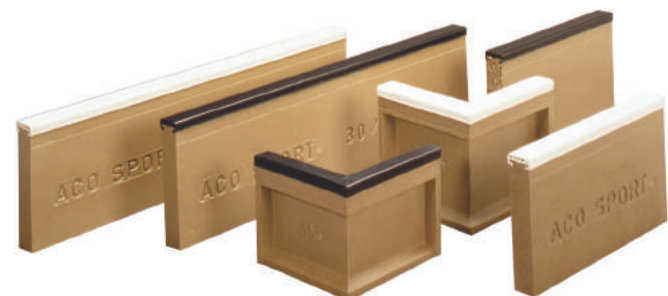
ACO Sport System 7000 safety curbs with cellular rubber capping for jump pits, borders and playgrounds.

ACO Sport offers a number of safety edge products to soften those transition areas. Channels and curbs that offer an integral, cellular rubber cap are proven to minimize the risk and severity of impact injuries.