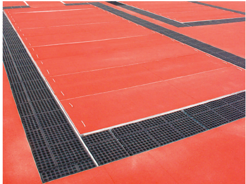
Safety curb edging around the jump pits provide soft edges to the jump pit once covers are removed.