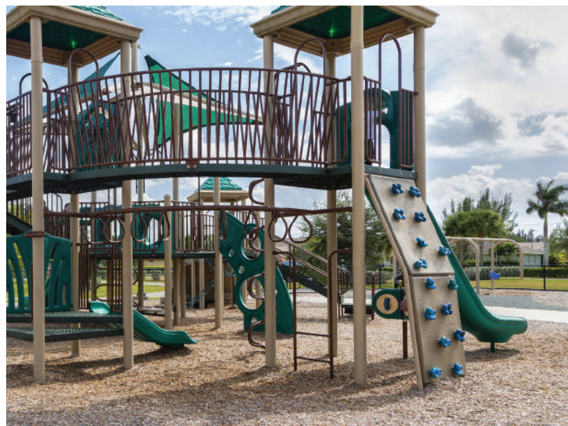
The rate of playground-related injuries at North Carolina childcare centers dropped 22% after a law passed requiring new playground equipment and surfacing in childcare facilities to conform to CPSC guidelines (source: Safe Kids USA).