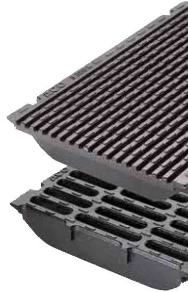
Slotted ductile iron Class F