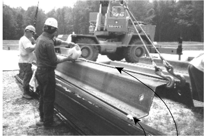
Figure # 1

One gallon of A-30 will treat approximately 140' - 150' of this interlock.