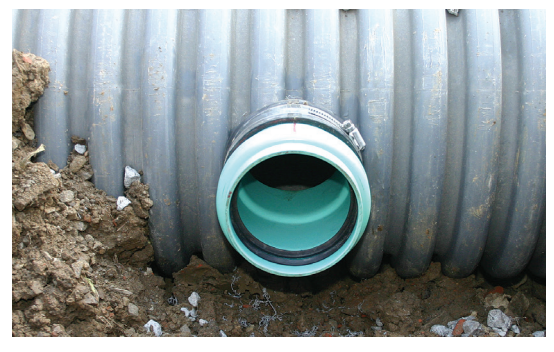
Inserta Tee Tap