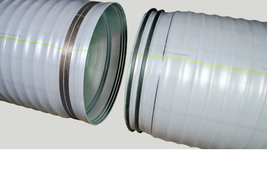
Triple Wall Design