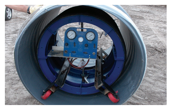
Joint Isolation Test

SaniTite HP meetisng ASTM F2764 is manufactured in 20' (6 m) or 13' (4 m) lengths for diameters 12"-48" (300-1200 mm), while the 60" (1500 mm) diameter is manufactured in 20' (6 m) and 16.3' (5 m) lengths. The 20' (6 m) lengths aid in speed of installation and reduce the total number of joints. However, the 13' (4 m) lengths are complimentary for deeper projects where trench box conditions require a shorter pipe.