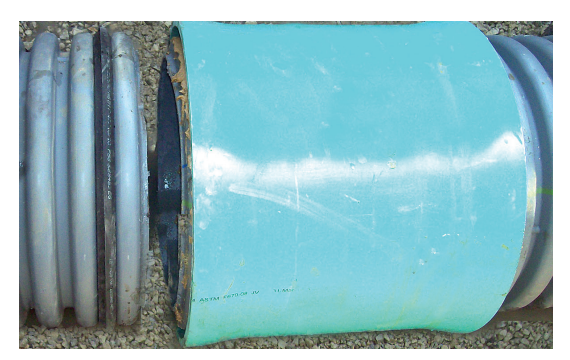
PVC Sleeve Coupler