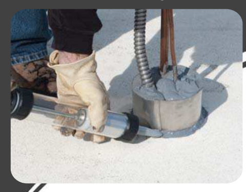
SAUSAGE GUN or