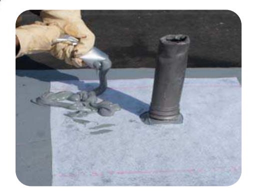
CUT & SQUEEZE

APPLICATION: 915 Fluid Flash can be dispensed manually. Simply cut a small hole at the top of the sausage with a utility knife and squeeze. It may also be applied by using a sausage type caulking gun. The substrate must be clean and free from grease and oils. Metals must be degreased with a suitable solvent. May be applied with a brush or trowel. Roofing granules may be embedded in top layer. Clean with xylene. For Professional Use Only.