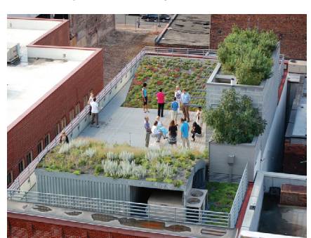
ASLA Headquartes - Washington, DC.