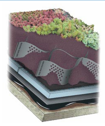
1. Product Name GardNet® Soil Confinement Assembly