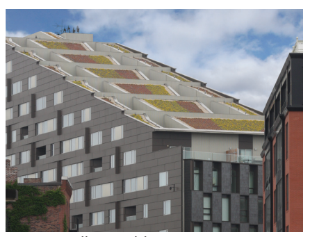
Macallen Building - Boston, MA

Technical service is provided by Hydrotech's Technical Services and Garden Roof Departments. Every GardNet application must be reviewed by American Hydrotech, Inc. prior to any material order or installation.