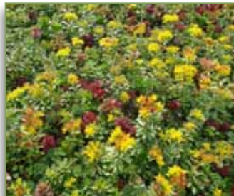
Four Season Year round interest

Customization - Custom tiles are available, contact Hydrotech for specifics.