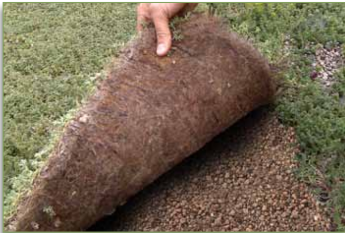
At time of delivery

Varieties - Wide variety of sedums suiting different climates and exposures.