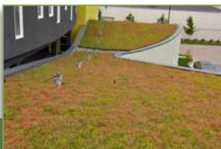
Tassafaranga Village - Oakland, CA

The pictures to the right are of the Mollie Dodd Anderson Library in Newtown, PA. InstaGreen Sedum Carpet was installed over 6,500 SF by a small crew in 7 hours.