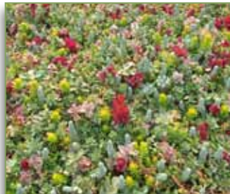
Full Color Maximum color impact