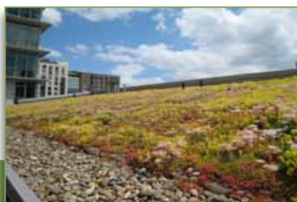
ASA Flats + Lofts - Portland, OR