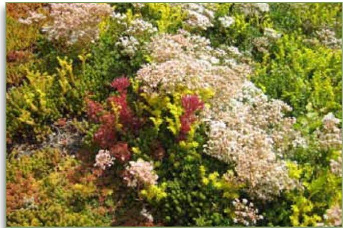
Within 2-3 months