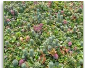
Rugged Hardest blend