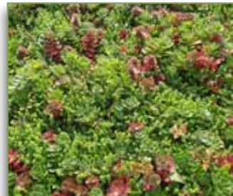
Shade Tolerant Withstands light shade