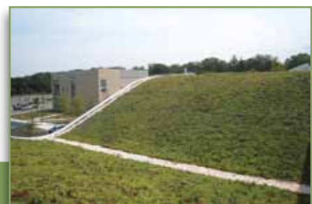
Georgian Court University - Lakewood, NJ