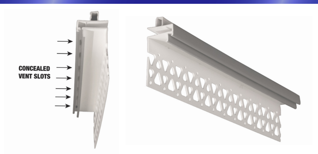
E-Z Vent's concealed vent slots allow air and water vapor to escape from within the interior cavity out the top of the wall