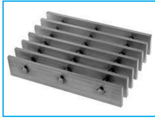
11-SR-2 Cross Rods 2" C/C