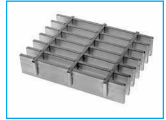
11-AP-2 Cross Bars 2" C/C