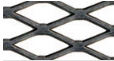
ASM .75-9F Maximum Security