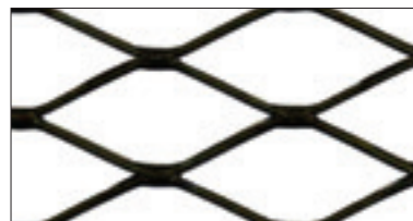
ASM 1.0-16F Minimum Security