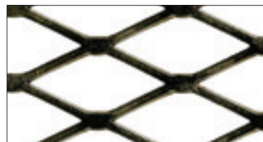
ASM .75-13F Medium Security