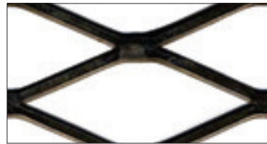
ASM 1.5-9F Medium Security