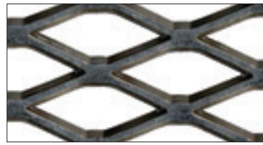
ASM .75-9F Heavy Modified Super Max Security for Industrial and Homeland Security applications