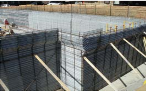
Blind Side Wall