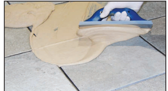
Revolutionary new creamy, smooth consistency