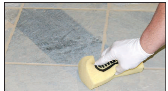
Wash after 30 to 40 minutes*