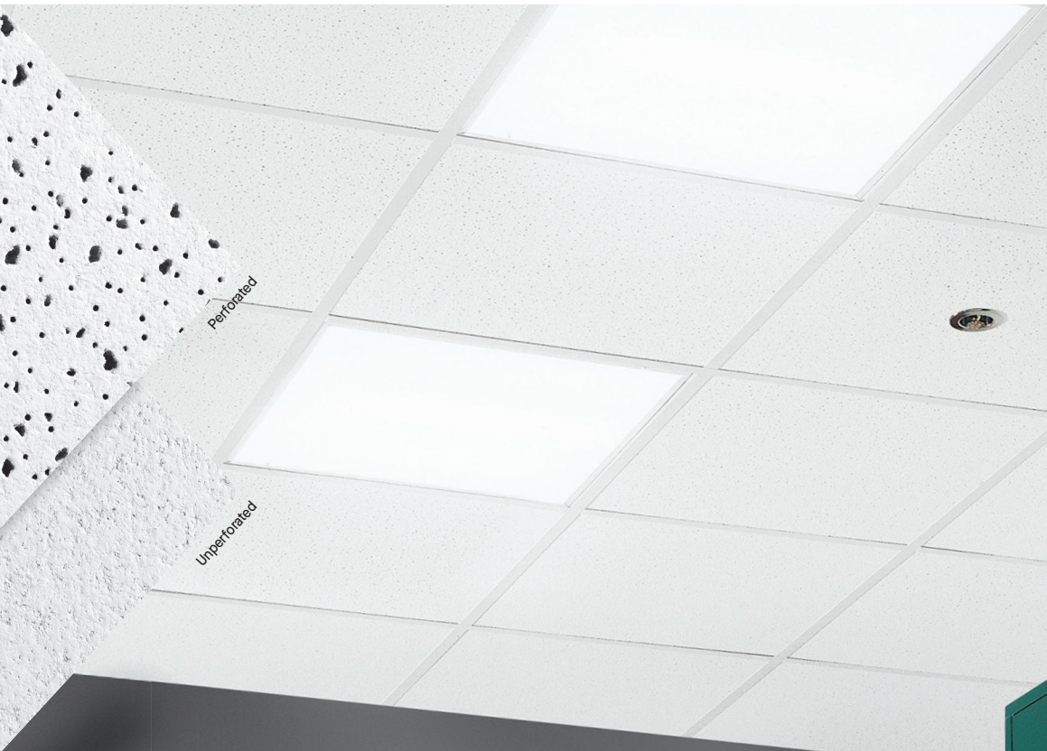
Ceramaguard panels with Prelude Plus XL Fire Guard 15/16" suspension system

CAD/Revit® drawings at: armstrongceilings.com/cadrevit