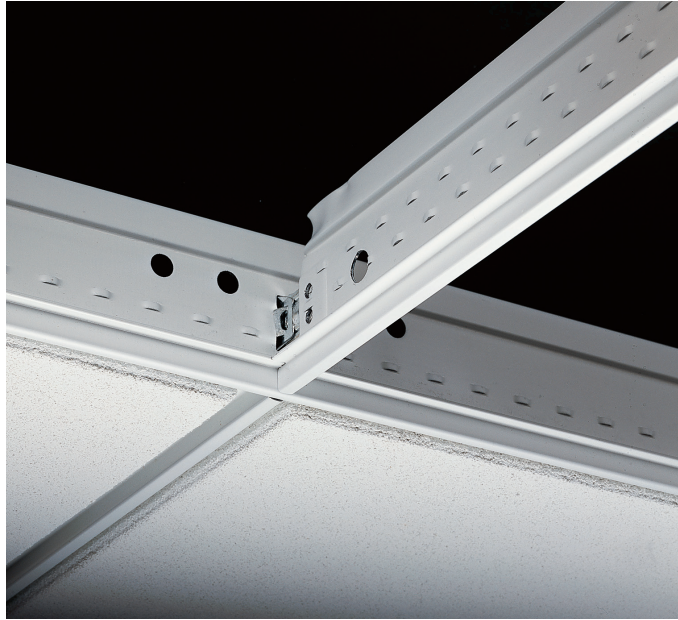
Interlude XL suspension system

This dimensional 9/16" suspension system offers high-recycled content for improved LEED® credits.