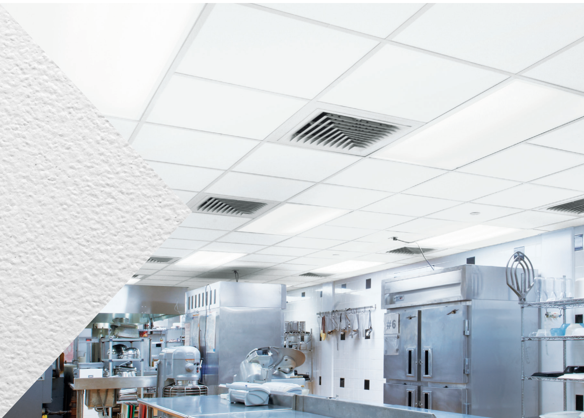
Kitchen Zone 24" x 24" panels with Prelude XL 15/16" suspension system

CAD/Revit® drawings at: armstrongceilings.com/cadrevit