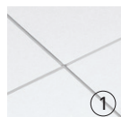
1. Lyra® Vector® with Prelude® XL® 15/16" suspension system

TechLine 877 276-7876 armstrongceilings.com/lyra