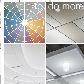
Lyra Vector panels with Prelude XL 15/16" suspension system

armstrongceilings.com/capabilities See more photos at: armstrongceilings.com/photogallery