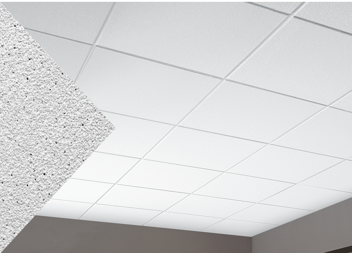
Mesa™ panels with Suprafine® XL® 9/16" suspension system

SUSTAIN® High Performance Sustainable Ceiling Systems