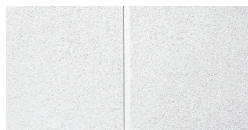
Mesa™ Second Look® II panel – Scoring created nominal 24" x 24" squares

DETAILS (Other Suspension Systems compatible. Refer to listing on next page.)