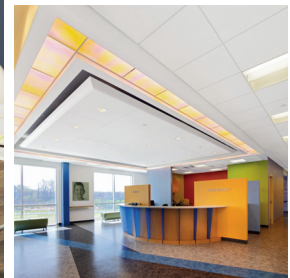
▲ Optima® PB Concealed panels with Prelude® XL® HD 15/16" suspension system

DESIGNFlex® A New World of Choice for Ceiling Systems