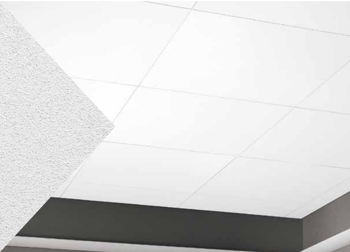
Optima PB Vector panels with Prelude® XL® 15/16" suspension system

CAD/Revit® drawings at: armstrongceilings.com/cadrevit