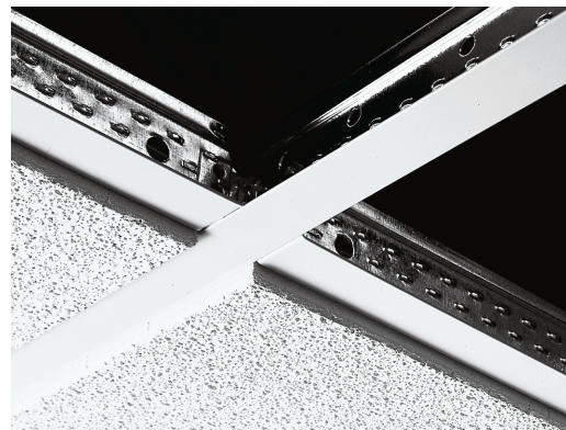
▲ Prelude XL suspension system

This hot-dipped galvanized steel 15/16" suspension system offers high recycled content for improved LEED® credits.