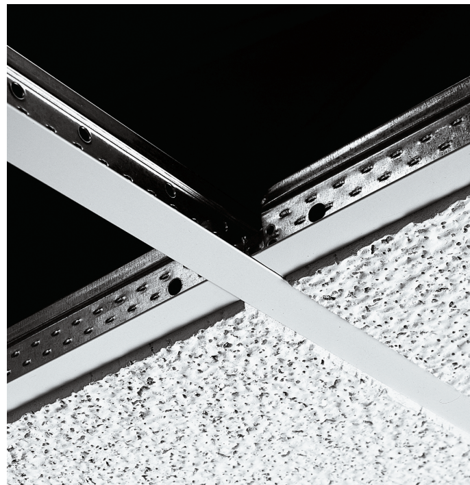
Prelude® Plus XL® suspension system

A 15/16" suspension system for severe environmental performance.