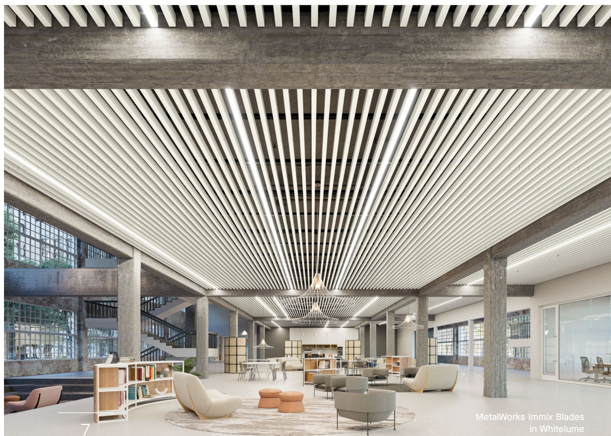
MetalWorks Immix Blades in Whitelume