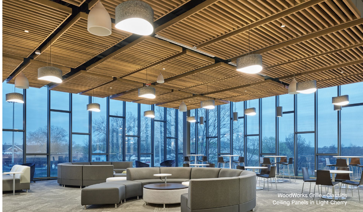
WoodWorks Grille – Classics Ceiling Panels in Light Cherry