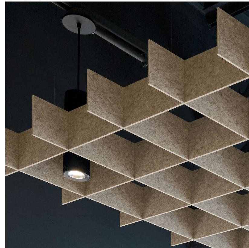
FeltWorks Open Cell in Mocha