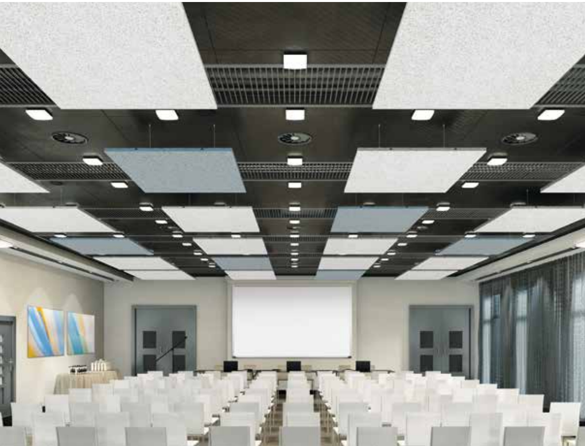
Tectum® Clouds in White and custom color

CAD/Revit® drawings at: armstrongceilings.com/cadrevit