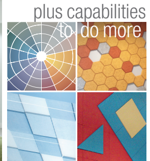
▲ Tectum Tegular 24" x 48" panels in White with Prelude® XL® 15/16" suspension system

CAD/Revit® drawings at: armstrongceilings.com/cadrevit