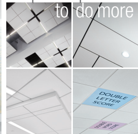
▲ Ultima® Beveled Tegular panels with Silhouette® 1/4" reveal 9/16" suspension system

armstrongceilings.com/capabilities See more photos at: armstrongceilings.com/photogallery